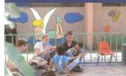
Playing with babies at the orphanage

-The start of a Bible Study on Evangelica